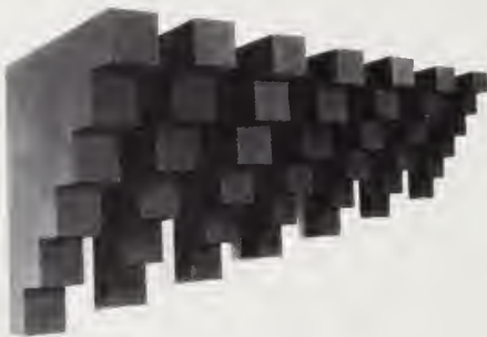
Robert Smithson, Alogon , 1966

The diminished vocabulary made possible only a narrow range of statements: certain of the sculptures of Andre, Judd, LeWitt, Robert Morris, Tony Smith, and Smithson appear virtually identical. Minimalism's programmatic attitude of pure research, while significantly innovative, soon became ungenerous and infertile. Its purity and perfection of execution quickly set such an exacting standard, and produced such definitive exemplars, that artists began seeking alternatives almost immediately. Yet among